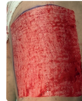
Day 0 – Skin Graft Donor Site