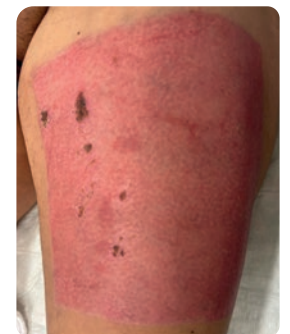
Day 21 – Follow-up examination 7 days after removal of the epicite® RESCUE dressing