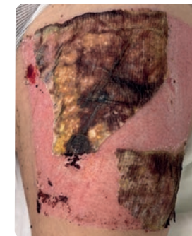
Day 14 – Partial removal of the epicite® RESCUE wound dressing one day prior to discharge