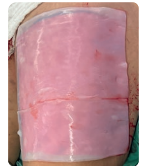
Day 0 – Donor Site covered with epicite® RESCUE